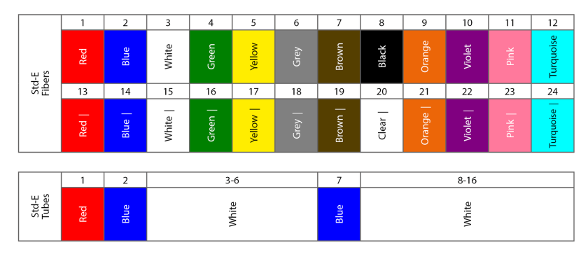
StdE Color Code Chart