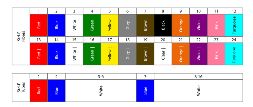
StdE Color Code Chart