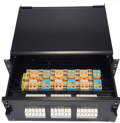
Power Distribution Box , Open