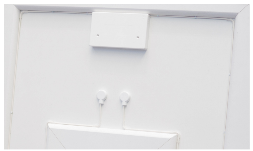
Cable Management Accessories Hexatronic MDU FTTH Lead In Glue Adhesive Clear Bend Radius Cable Retainers Discreet Fibre Optic