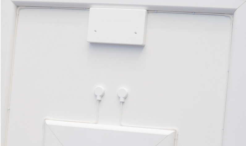
Cable Management Accessories Hexatronic MDU FTTH Lead In Glue Adhesive Clear Bend Radius Cable Retainers Discreet Fibre Optic