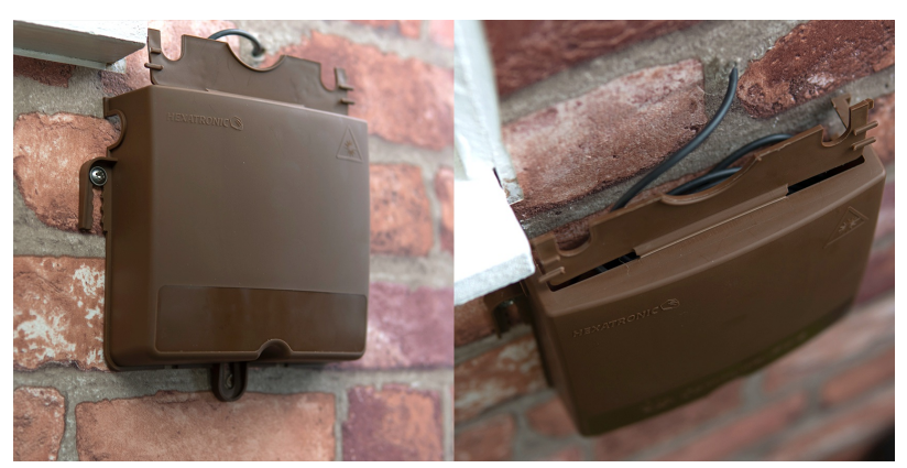
Capacity: 15m (3mm)