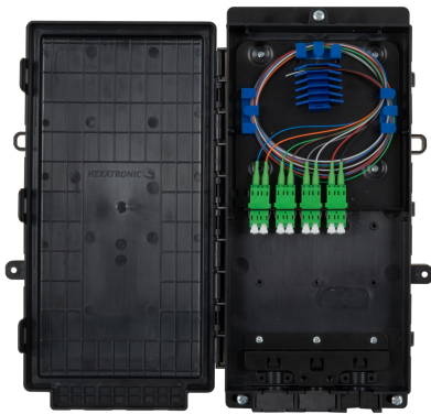
Customer Termination Box Brown Black Grey MDU Hexatronic Wall Box Fiber Optic P2P and P2MP networks