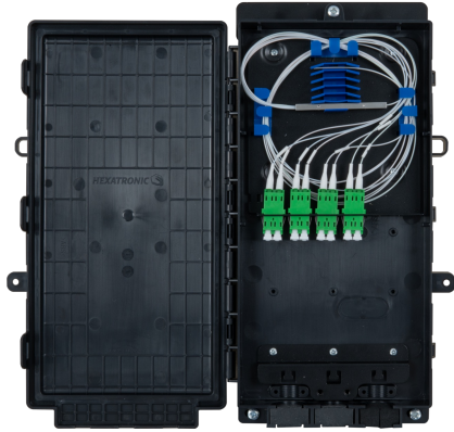
Customer Termination Box Brown Black Grey MDU Hexatronic Wall Box Fiber Optic P2P and P2MP networks