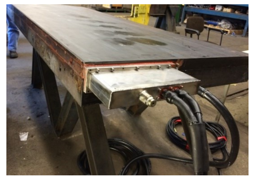
Example instrumented mold plate, with robust optical cable connections